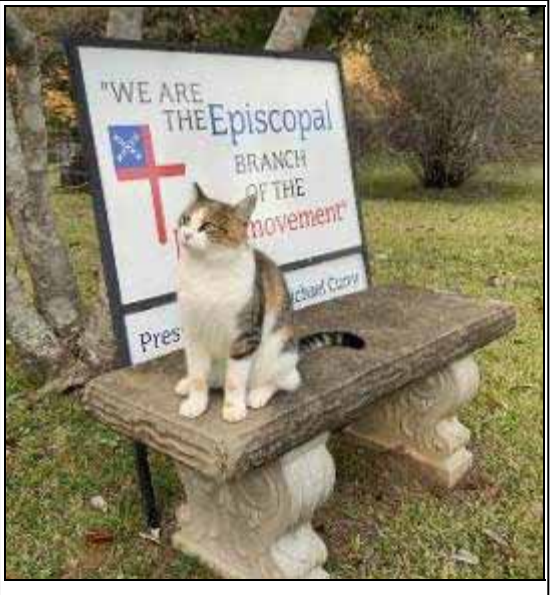
Salome (Sally Mae) continues to warm the hearts of church members