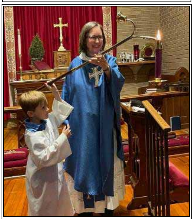
Fore lights the candle of LOVE