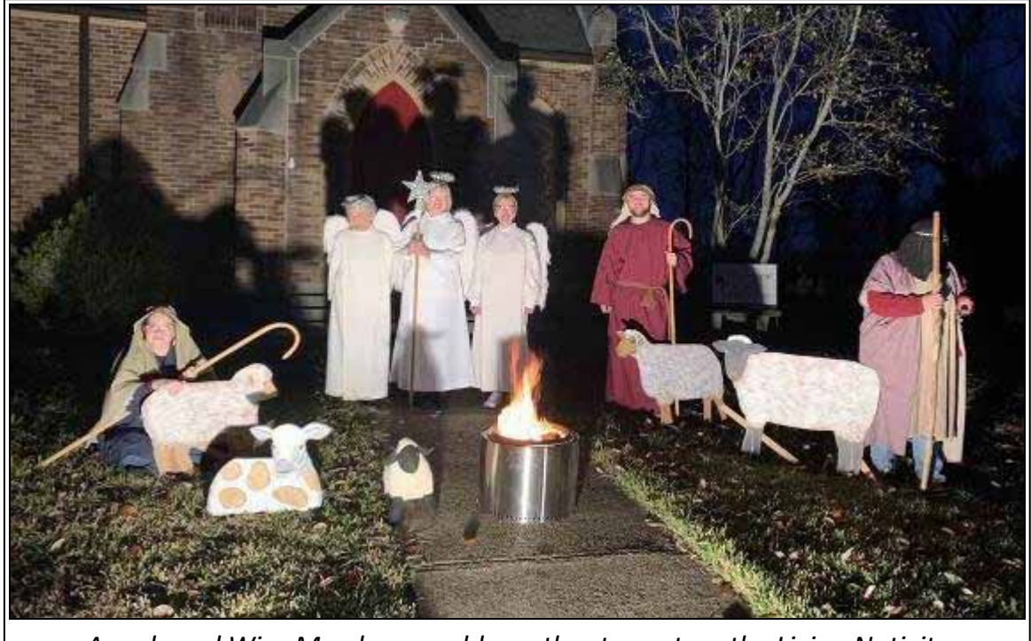
Angels and Wise Men brave cold weather to portray the Living Nativity