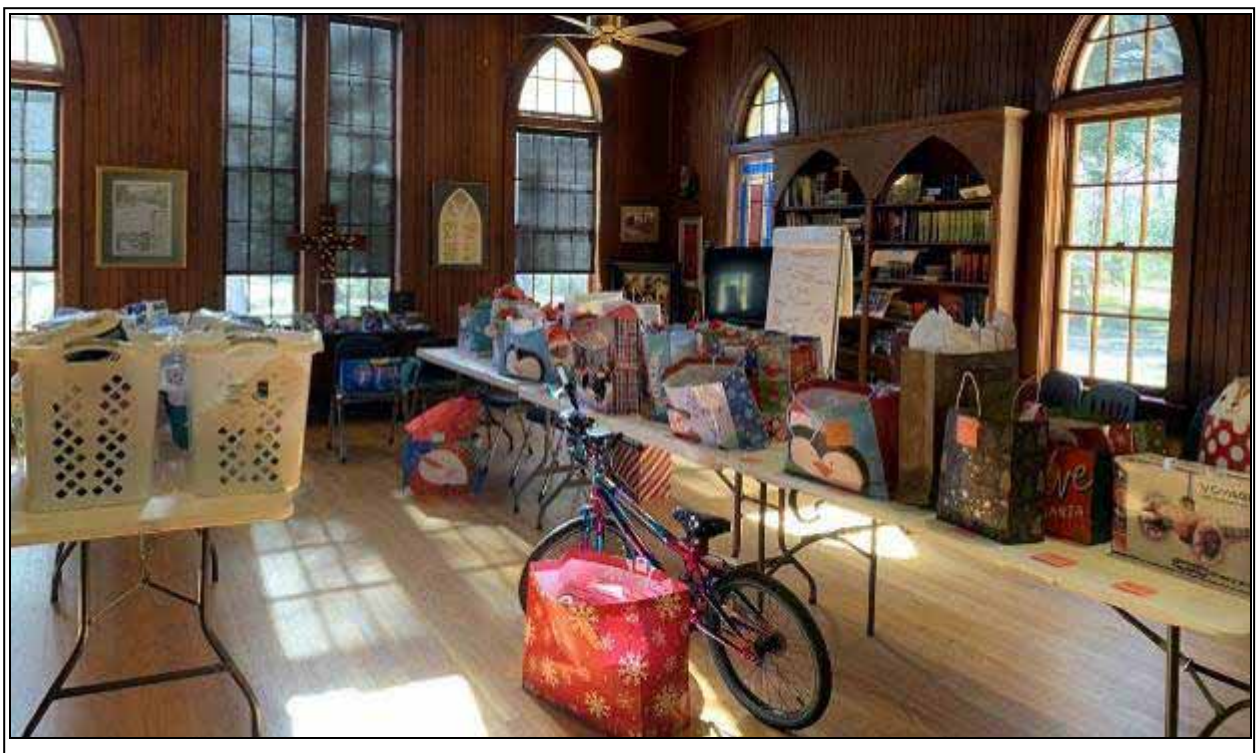
The Parish Hall filled with gifts and toys for the children